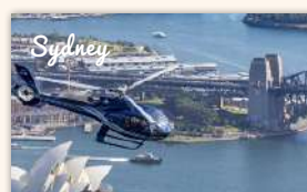
Helicopter Flight over Harbour 536 booked ★★★★★