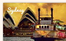
The Showboat Classic Dinner Cruise 498 booked ★★★★★