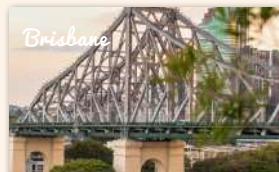
Story Bridge Adventure Climb 650 booked ★★★★★