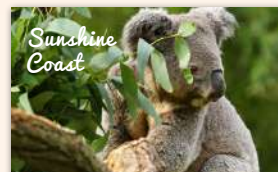
Australia Zoo Admission 863 booked ★★★★★