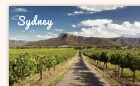
Hunter Valley Boutique Wine Tour 880 booked ★★★★★