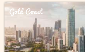
Gold Coast Nature & Wildlife Tour 550 booked ★★★★★