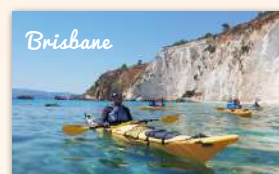
Riverlife Adventure Brisbane 340 booked ★★★★★