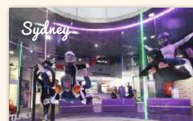
iFLY Downunder Indoor Skydiving 330 booked ★★★★★