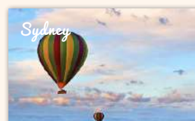
Hot Air Balloon Sunrise Flight 890 booked ★★★★★