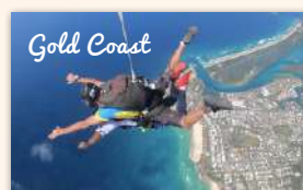
Beach Landing Tandem Skydive 880 booked ★★★★★