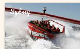
Sydney Harbour Oz Jet Boating Shark Attack Thrill Ride 650 booked ★★★★★