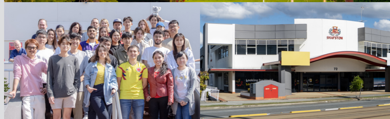
GOLD COAST CAMPUS